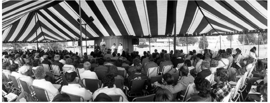
Nebraskans gather under the familiar blue-and-white striped Chautauqua tent.