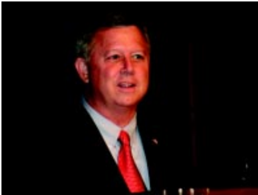
Gov. Dave Heineman introduces Michael Beschloss.

This evening I thought I would talk about the book that I published just a few months ago called "Presidential Courage," which is about 200 years of American history. What I try to do is look at moments in history where this country was essentially saved by having a courageous president, someone who was willing to give up, if necessary, at a crucial moment, his popularity or his reelection or, in some cases, even his life.