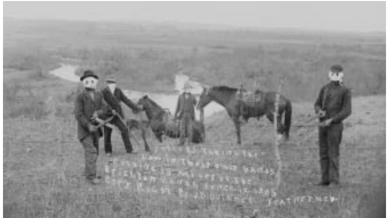
“Settlers taking the law in their own hands—cutting fence on old Brighton Ranch.” This is a theatrical reenactment (circa 1900), staged by photographer Solomon D. Butcher to illustrate a historical event for his “Pioneer History of Custer County.” The photo indicates the pivotal role of fences in the settlement of the Great Plains.

The council is committed to preparing our youth for citizenship. In addition to 107 Speak-